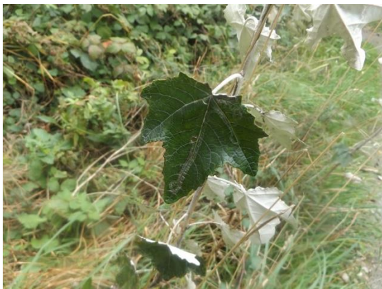
White Poplar

The team have then returned to class to identify them from the photos. They have utilised various keys, online quizzes and apps to help identify the species.